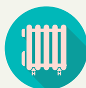
NEW CENTRAL HEATING